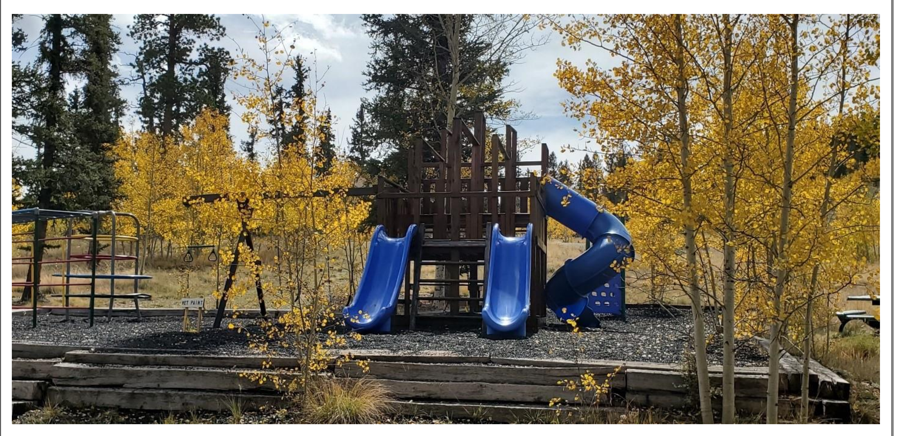
The climbing bars at the playground also received a new a coat of paint.