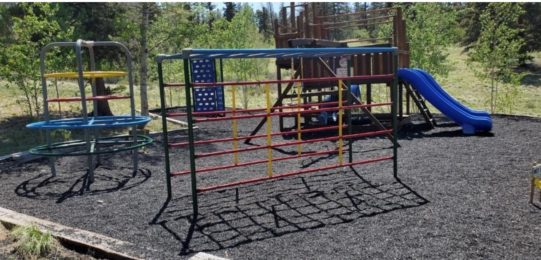
"No Motor Vehicle" signs were also posted at the park as well as updates to other signage.