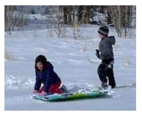
Fun times were had by all! The fresh snow on Friday night was grear!