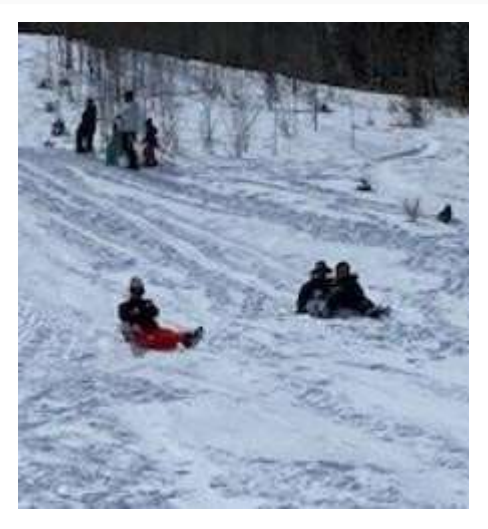
Our February event was a hit!! On February 12th, the IMPOA board hosted a sledding day with hot chocolate and cookies. If there is enough interest, we'd love to do this again!