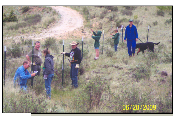
Repairing IM Fence

• The Southwest Conservation Corps was hired to connect the Elk and the Coyote Trail. These two trails are part of the Indian Mountain Nature Trail System. There are five connecting trails within the Park with the trail head for all trails beginning just past the picnic pavilion.